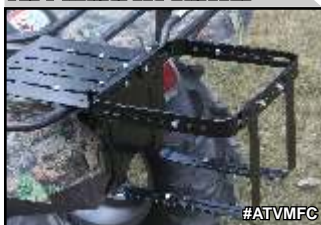
ATV Multi-fit Carrier