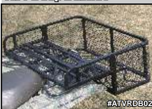
ATV Deep Basket