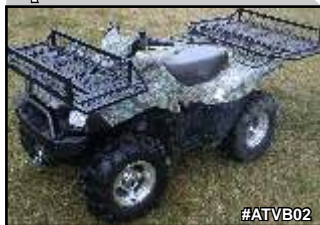
2pc ATV Basket Set