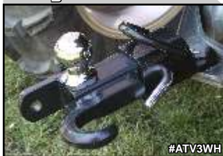
3-Way ATV Hitch