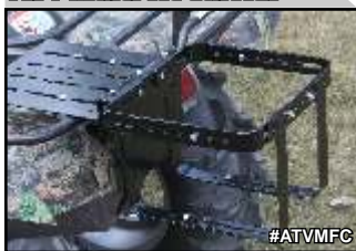
ATV Multi-fit Carrier