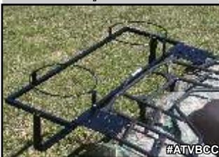
ATV Bucket/Crate Carrier