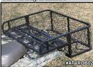
ATV Deep Basket