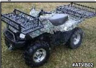
2pc ATV Basket Set